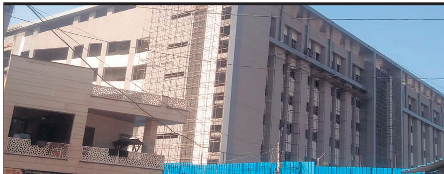
The under-construction building of medical college at Bhiwani.

“Moreover, no big project has come to the constituency. Even the projects approved during my tenure like the medical college at Bhiwani is yet to be commissioned. The MPLADS funds have not been used for the development of villages, nor did the area get any benefit of being included in the NCR,”