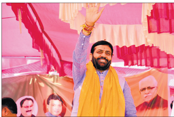
CM Nayab Saini at his native village in Ambala.

The CM said, “We will work and pay our respect to