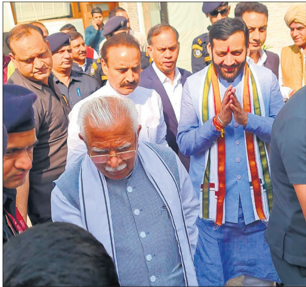
Chief Minister Nayab Singh Saini and former CM Manohar Lal Khattar come out after a meeting in Karnal.

Saini had been elected as an MP from Kurukshetra, but after the resignation of Khattar, he was elevated as the Chief Minister and now he is required to become an MLA within six months from assuming the charge. The Election Commission has also announced Karnal Assembly bypoll with the Lok Sabha elections.